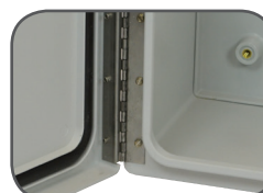
Formed-In-Place (FIP) gasket, 316 stainless steel hinge, boss