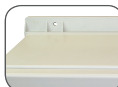
Molded-in mounting flange